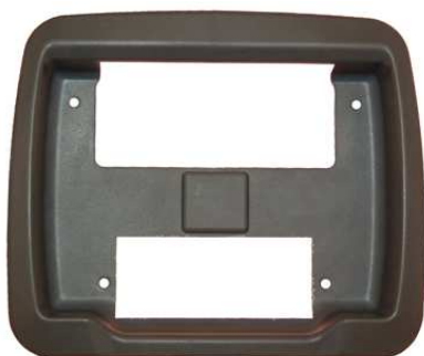
Template - 068959-M

7 - Because of further installation, place the cabling behind the monitor holder, following figure N°11