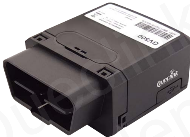
Figure 1. Appearance of GV500

GV500 is based on the OBD II interface GPS vehicle tracking device, compact design and easy to install. GV500 contains an OBD II connector which complies with J1962 standard, a 10PIN USB connector, an internal GSM antenna, an internal GPS antenna and three LEDs.