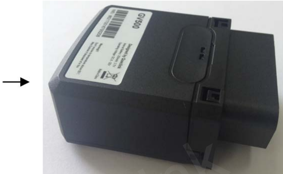
Figure 4. Closing the Case