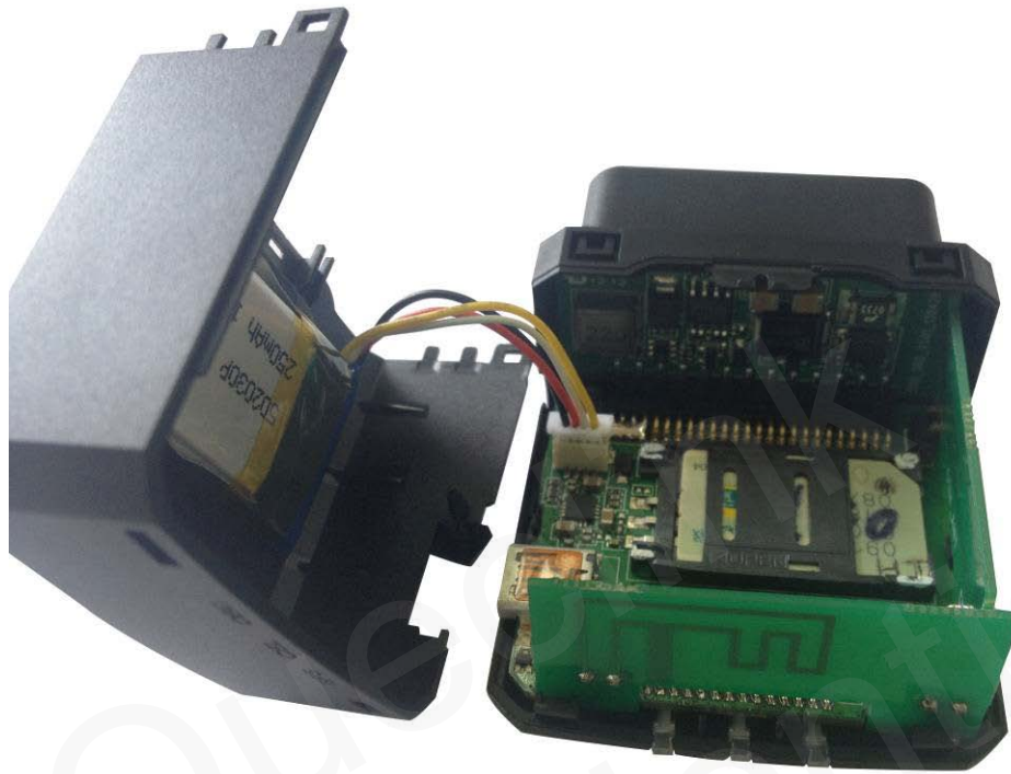
Figure 6. Backup Battery Installation

There is an internal backup Li-ion battery.