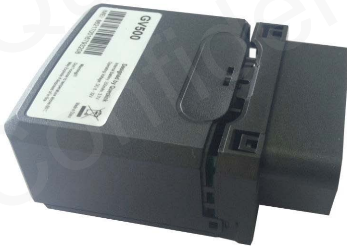
Figure 3. Opening the Case