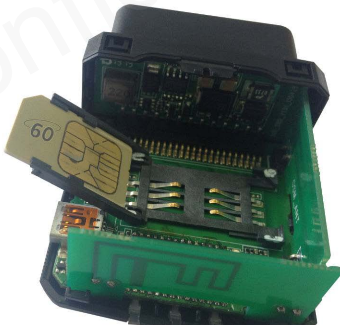
Figure 5. SIM Card Installation

Open the case and ensure the unit is not powered. Slide the holder right to open the SIM card. Insert the SIM card into the holder as shown below with the gold-colored contact area facing down taking care to align the cut mark. Close the SIM card holder. Close the case.