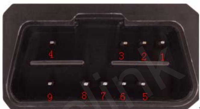
Figure 2. The OBD II connector on the GV500

The GV500 has an OBD II connector. It contains power supply and interfaces of CAN bus, K-line, L-line and J1850 bus. The sequence and definition of the OBD II connector are shown in following figure: